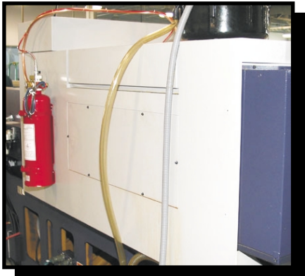
Image 2 - Installed Firetrace ILP system

Swiss-Type Turning Centers are the standard in precision metal working across the world (see Image 1 ). The machines are used extensively to manufacture an array of products, including medical instrumentation, electronics, fiber optics, automobiles, business machines, aerospace, defense, firearms, tools, valves, fasteners, etc. Manufacturing companies using these machines continue to increase their unattended machine operation and around the clock production. Although these machines are designed to be inherently safe from fire, human error can lead to a potentially devastating fire—especially since they use lubricants and coolants that can ignite if exposed to extremely high temperatures. And, since these machines can cost upwards of $300,000, machine repair and downtime could be very costly.