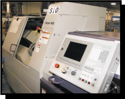
Image 1 - Swiss-Type Turning Center

Swiss-Type Turning Centers are the standard in precision metal working across the world (see Image 1 ). The machines are used extensively to manufacture an array of products, including medical instrumentation, electronics, fiber optics, automobiles, business machines, aerospace, defense, firearms, tools, valves, fasteners, etc. Manufacturing companies using these machines continue to increase their unattended machine operation and around the clock production. Although these machines are designed to be inherently safe from fire, human error can lead to a potentially devastating fire—especially since they use lubricants and coolants that can ignite if exposed to extremely high temperatures. And, since these machines can cost upwards of $300,000, machine repair and downtime could be very costly.