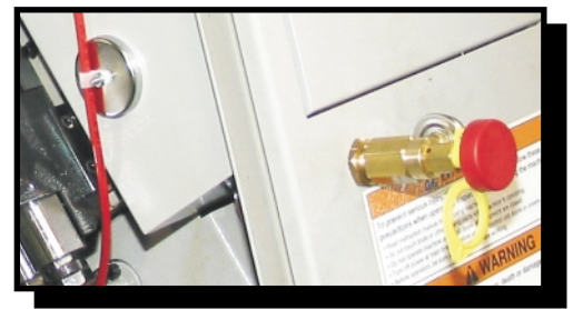
Image 5 - Manual Release & FDT mount