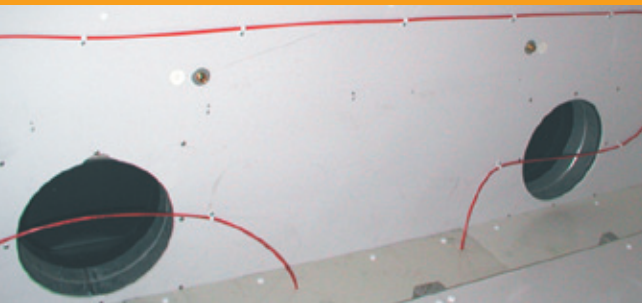
Firetrace detection tubing installed in front of the fume cabinet’s exhaust – directly in the path of a fire.