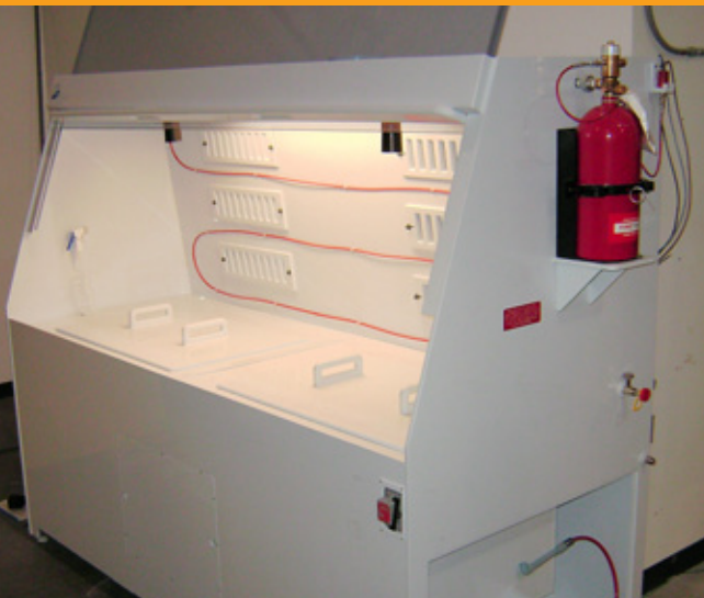
Firetrace detection tubing installed behind the fume cabinet’s baffle assures fast and reliable fire detection.