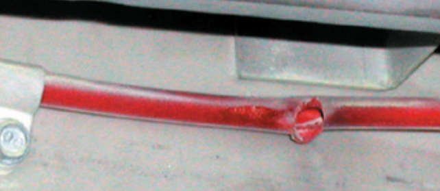
The Firetrace tubing “bursts” at the point of highest heat, triggering the release of the fire-extinguishing agent.