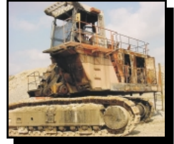
Non-Fabtek equipment 1

Logging equipment is subjected to some very harsh environments while performing harvesting functions. These sturdy workhorses stand up to everything—except fire! The risk of fire can be quite high with the machines being in the continuous presence of dry brush and leaves. If these items come in prolonged contact with the high temperature components of the engine, exhaust or hydraulic systems, they may ignite. If this occurs, there is the danger of igniting one or more of the various flammable