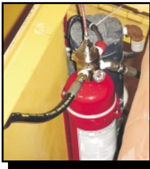
The new FM Approved system was used.

Recently, a Firetrace distributor in the upper-Midwest installed an Indirect Low-Pressure Firetrace system using FM-200 ® on a FabTek ® Harvester 1 . Firetrace was used to protect the engine compartment and hydraulic pump area. The system will completely engulf the engine compartment with FM-200 ® and immediately suppress a "work-stopping" fire. In addition, a manual release was located in the cab to allow manual activation of the system. An audible alarm was also installed in the cab to notify the operator of system actuation (see picture on right).